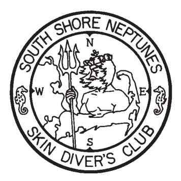
P.O. Box 518 Quincy, Massachusetts 02169