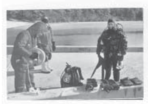
CHECKING THE REEL & WAITING FOR ROY