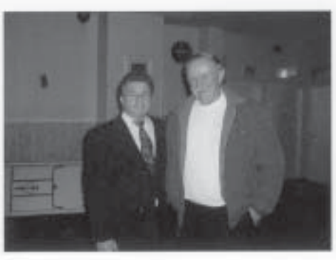
RUMOR HAS IT THAT THESE TWO WERE TELLING WAR STORIES ABOUT THEIR YOUNGER DAYS