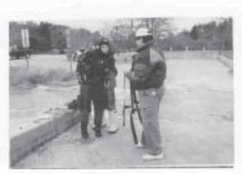
SOME PRE-DIVE CHIT-CHAT