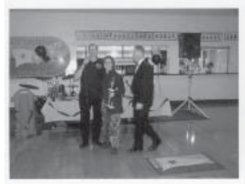
JEANINE FABIAN PHOTOGRAPH OF THE YEAR. COMPETITION DIVE - 1ST PLACE SNORKEL, 2ND PLACE SCUBA