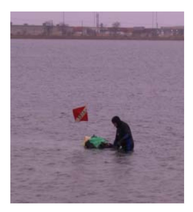
NEW YEARS DAY 2007