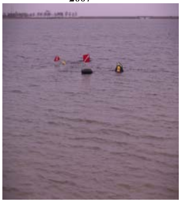
The 2007 season is underway.