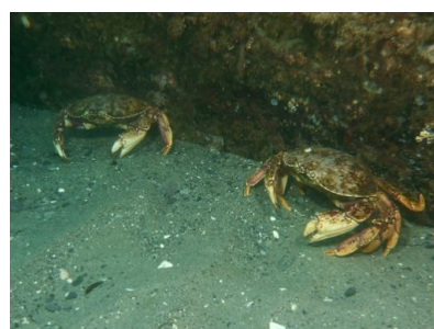
Top row: Rock crabs Middle row: Hermit crab & orange sponge Bottom row: Shiny piece of trash