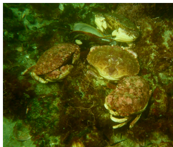
L-R from top row: Star, Quahog, Blood star, Oyster, Feeding anemone, Anemone cluster, Sea Raven, Single anemone side shot, Juvenile red sea raven, Crab-jammed "parking lot"