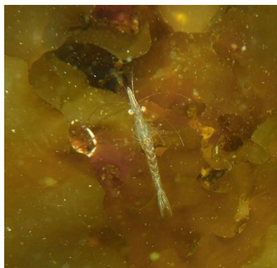
L. Horseshoe crabs mating R. Mysid shrimp

Almost immediately we ran into nudibranchs, a sea worm writhing on the bottom, a smiling clam, a pair of mating