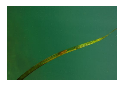
L-R. Baltic Isopod on eel grass; Moon snail

heads and finally decided Plum Cove was the only spot where we could hope to get in. We caravanned over to the cove, which was looking good, unloaded our gear, and left Bonnie to stand guard while we parked our cars elsewhere and walked back to the dive site.