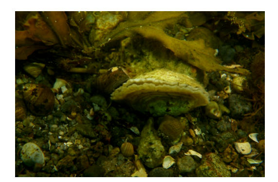
European Flat Oyster