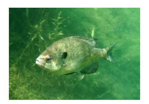
We live surrounded by beauty. All we have to do is look.