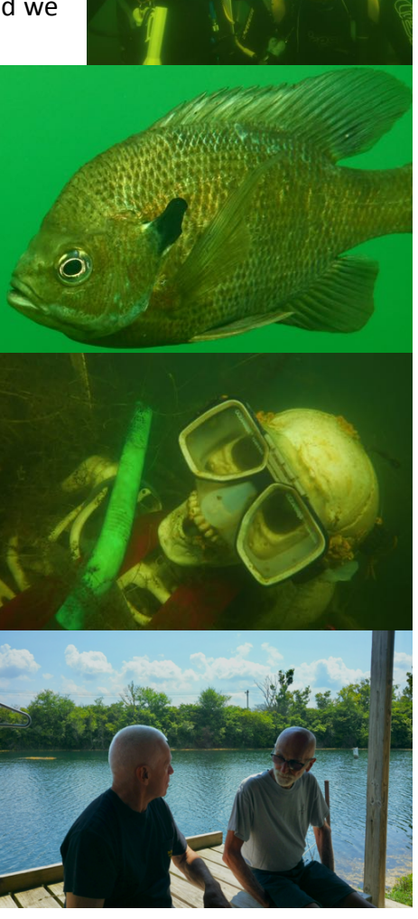
Top to bottom:John S& Chuck N; panfish; Jolly Roger Diver: John S & Rick Blaine sharing stories

"The bladderwort genus contains 220 widely distributed species of plants characterized by small hollow sacs that actively capture and digest tiny animals such as insect larvae, aquatic worms, and water fleas." Still, there are sights to behold. In some parts it would seem as though the water was as clear as in the Caribbean,