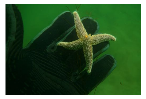
Clockwise: FourPoint Forbes Star regenerating 5th arm; juvenile winter flounder; anchor rode and chain; "flying " Forbes Star

Patrick helped me suit up, finished his own effort quickly, and rolled in. I followed suit, executing a backward roll as well. The surge, swells, and outgoing tide made swimming the short distance to the anchor line a small effort,