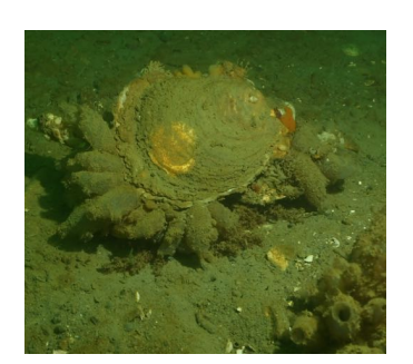
L-R. Lost shoe fin, skate, oyster on tunicates