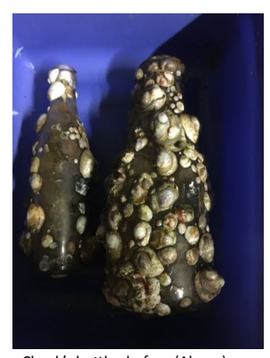
Chuck's bottles before (Above) and after (Right).

lost fin from the Sober Up dive. We decided to turn the dive into a trifecta: a fin dive, a bottle dive, and a picture dive. We got two of the three—the fin(No photo) and some bottles. When I headed out to